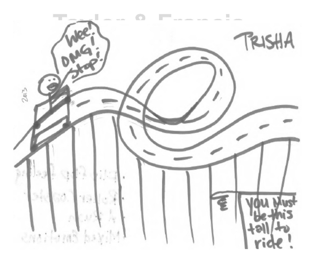
Figure 23.3 Drawing From a Student in Response to the Question "What Does Graduate School Feel Like?"

Fourth, drawings provide an interesting, vibrant, and easy-to-remember representation practice that is useful in today's increasingly technologically mediated world. People process visuals 60,000 times faster than text, and while they remember only 10% of what they hear and 20% of what they read, they remember 80% of what they see and do (Byrom, 2014). We have found that audiences and students perk up during research presentations that include drawings and other visual elements.