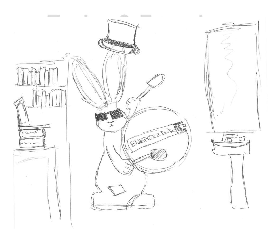
Figure 23.4 Drawing From a Student in Response to the Prompt "Draw an Ideal Leader"

As discussed, drawing activities coupled with metaphor analysis have a number of distinct empirical, power-sharing, pedagogical, and representational benefits. As a creative approach to research, these methods generate vivid and compelling data that can lead to insightful, memorable analyses. They are