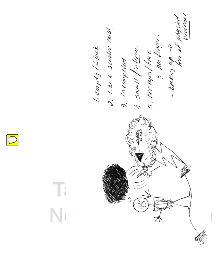
Figure 23.2 Drawing From Target of Workplace Bullying Responding to the Question "What Does Workplace Bullying Feel Like?"